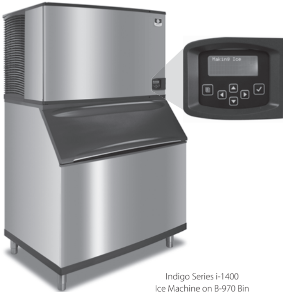
Indigo Series i-1400 Ice Machine on B-970 Bin

Designed for operators who know that ice is critical to their business, the Indigo™ Series ice machine's preventative diagnostics continually monitor itself for reliable ice production. Improvements in cleanliness and programmability make your ice machine easy to own and less expensive to operate.