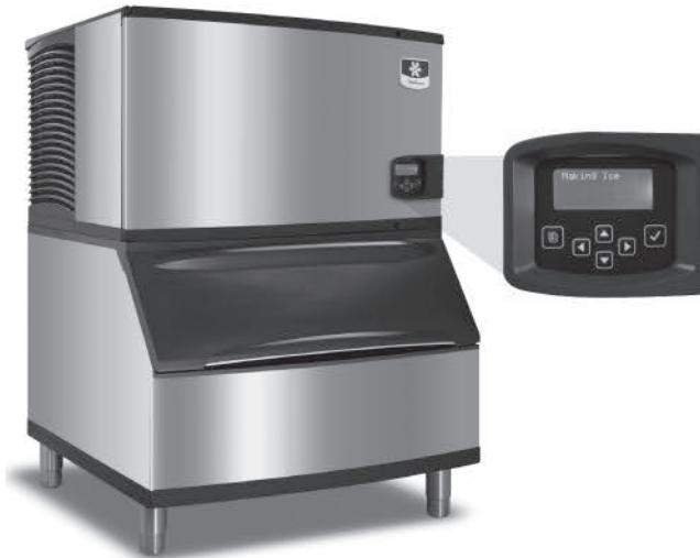
Indigo Series i-300 Ice Machine on B-170 Bin

Designed for operators who know that ice is critical to their business, the Indigo™ Series ice machine's preventative diagnostics continually monitor itself for reliable ice production. Improvements in cleanability and programmability make your ice machine easy to own and less expensive to operate.