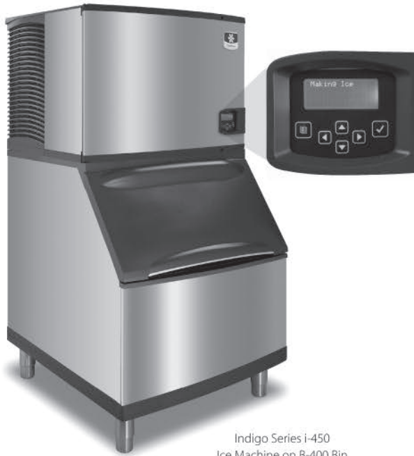
Indigo Series i-450 Ice Machine on B-400 Bin

Designed for operators who know that ice is critical to their business, the Indigo™ Series ice machine's preventative diagnostics continually monitor itself for reliable ice production. Improvements in cleanability and programmability make your ice machine easy to own and less expensive to operate.